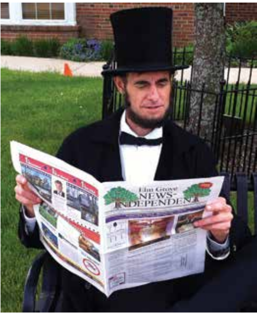
“Abraham Lincoln” reads the July issue of the Elm Grove News-Independent.