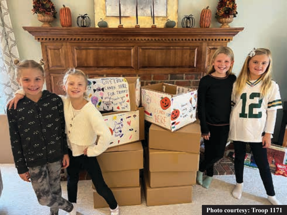
Brownies from Tonawanda Elementary School - Troop 1171