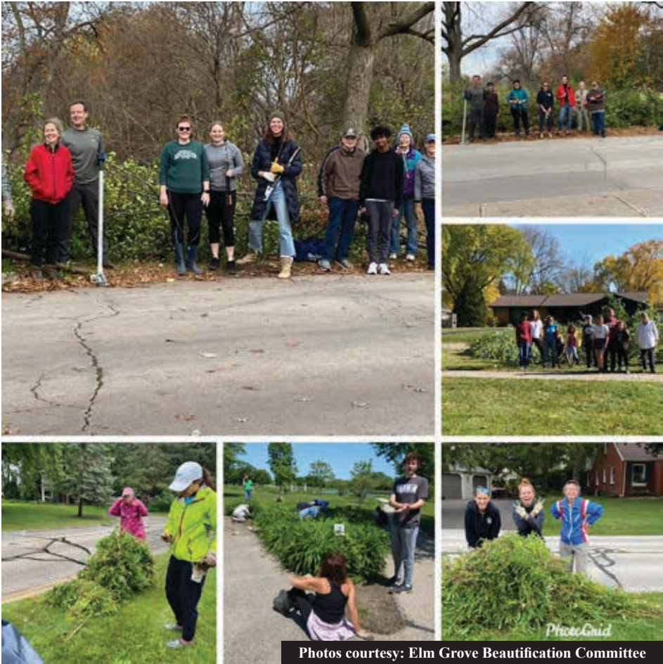
Elm Grove Invasive Species Task Force members at work in the Village.